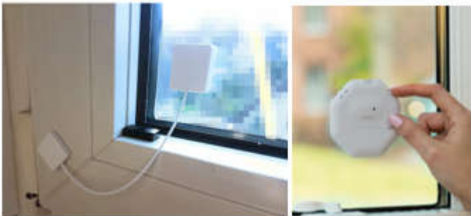
Glass break detection sensors for security system

If you have any information regarding suspects matching the above situations, contact WLA Burglary Detective Carrillo at (310) 444-1568 / (213) 216-5308.