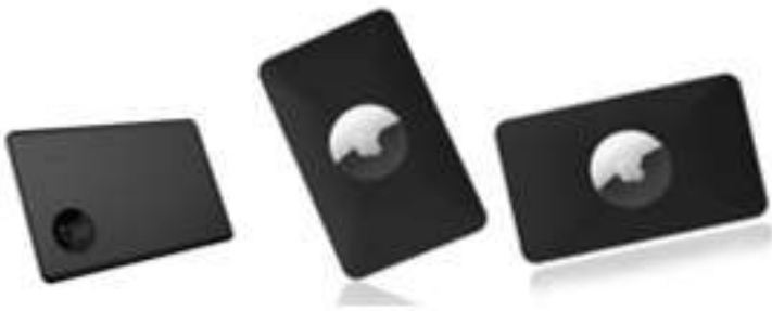
For wallets and or purses