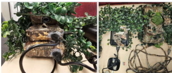
Camouflage outdoor camera with battery pack seen on similar case in different affluent jurisdiction.