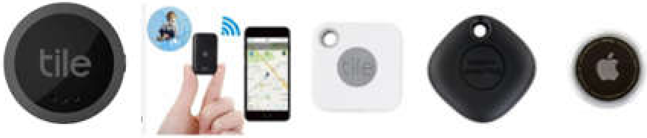
GPS tracking device examples